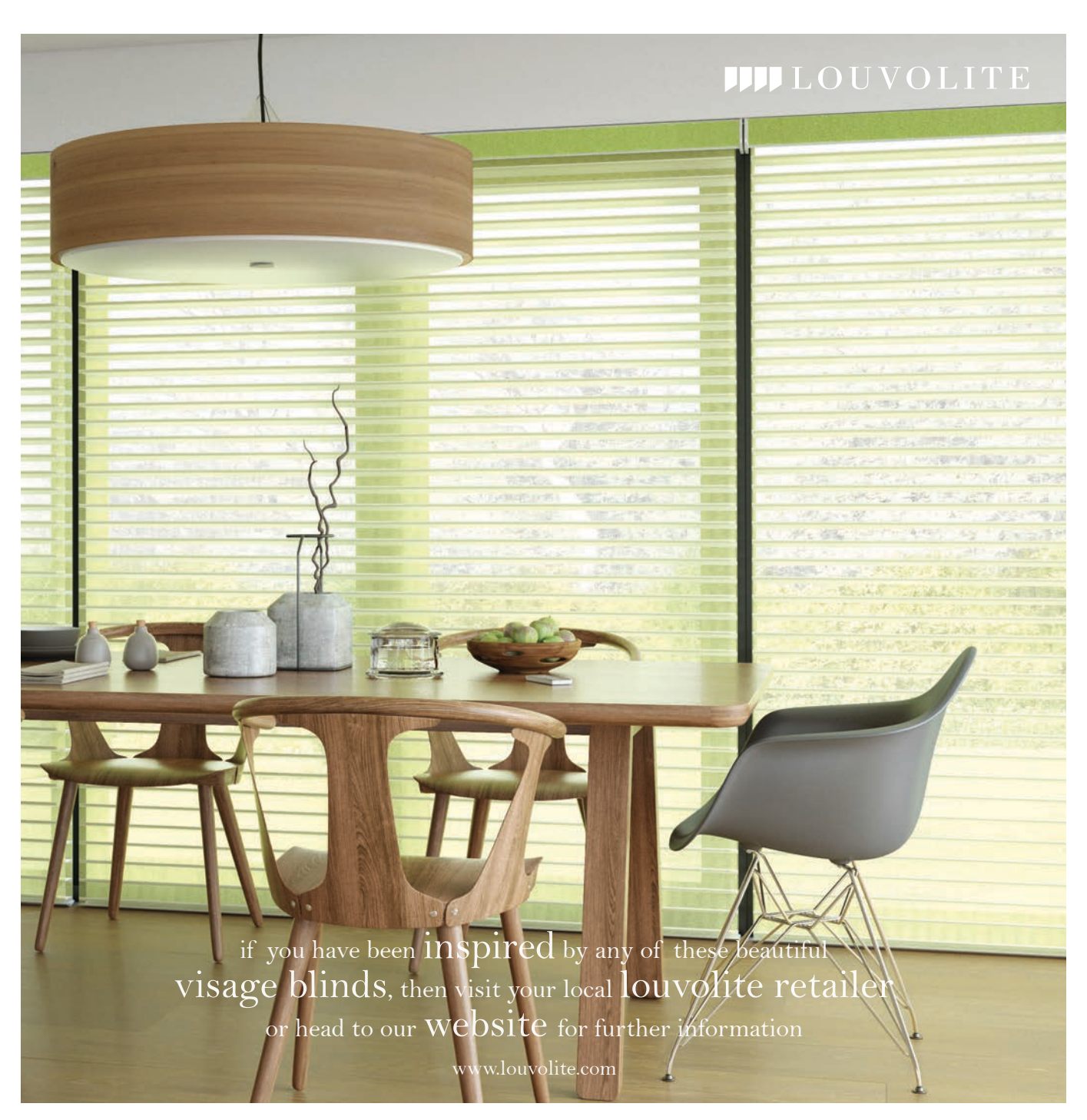
your local louvolite® accredited visage blinds retailer...